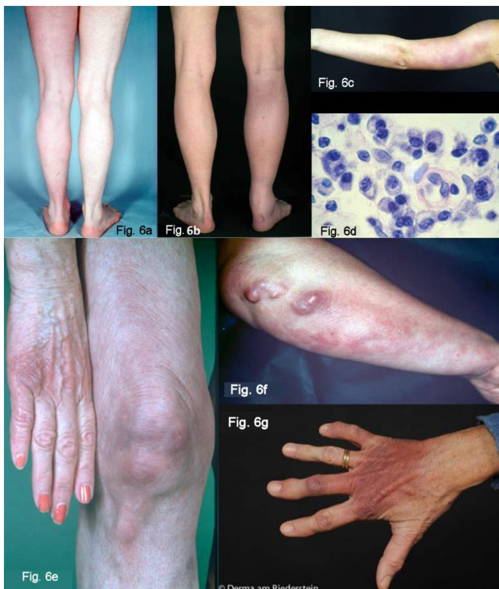
Figure 6: Late cutaneous manifestations