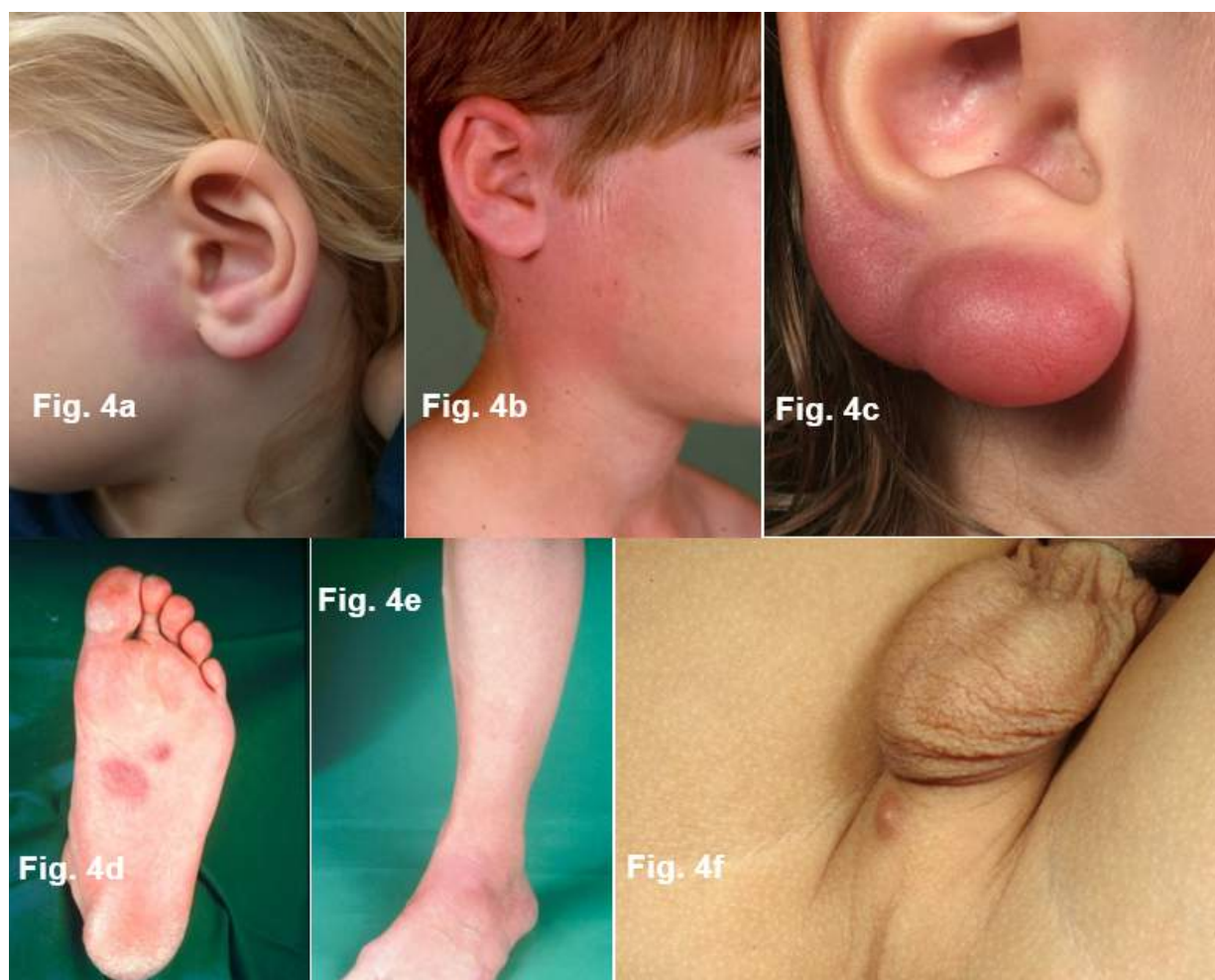
Figure 4: Borrelial lymphocytoma

Fig. 4a: Borrelial lymphocytoma preauricular and on the left earlobe