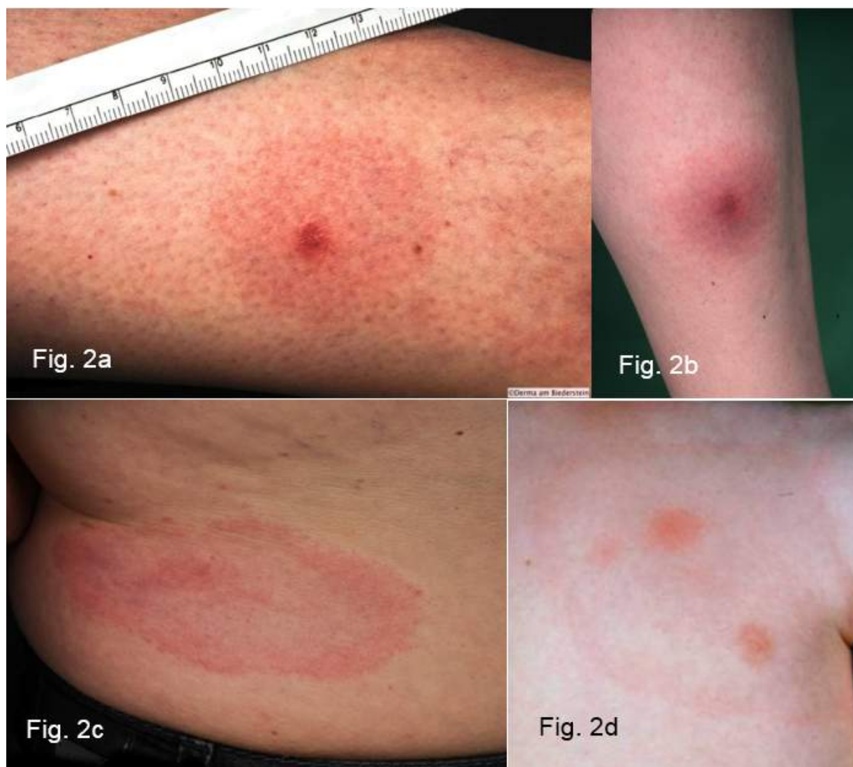
Figure 2: Clinical variations of erythema migrans

Fig. 2a: Initial seronegative erythema migrans 1 week after tick bite DD reaction to insect bite; diameter 4.9 cm, progression under observation