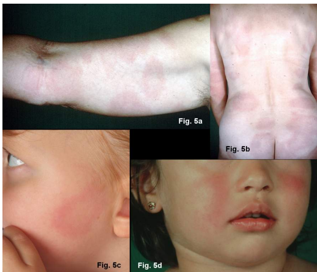
Figure 5: Multiple erythema migrans (MEM)

Fig. 5a and 5b: Pronounced erythema migrans on the right arm, approx. 40 more on the torso and lower extremities Fig. 5c: Oval erythema on the left cheek, many similar erythemas on the torso and upper leg a sign of early disseminated borreliosis Fig. 5d: Symmetrical redness on the cheeks of a 5-year-old girl with multiple erythema migrans on her trunk and extremities, accompanied by flu-like symptoms