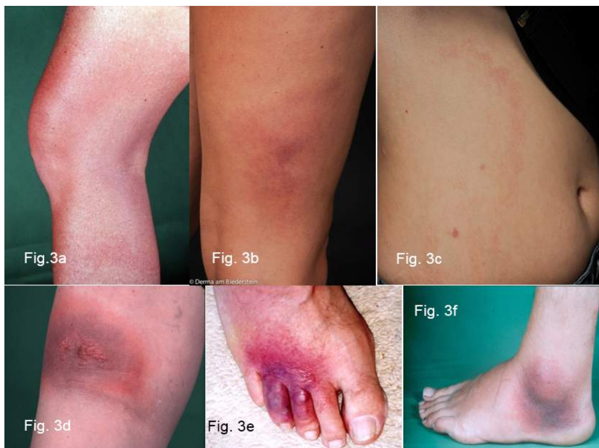
Figure 3: Variability of the erythema migrans

Fig. 3a: Flaming red erythema chronicum migrans with radiculitis on the left leg, DD erysipelas